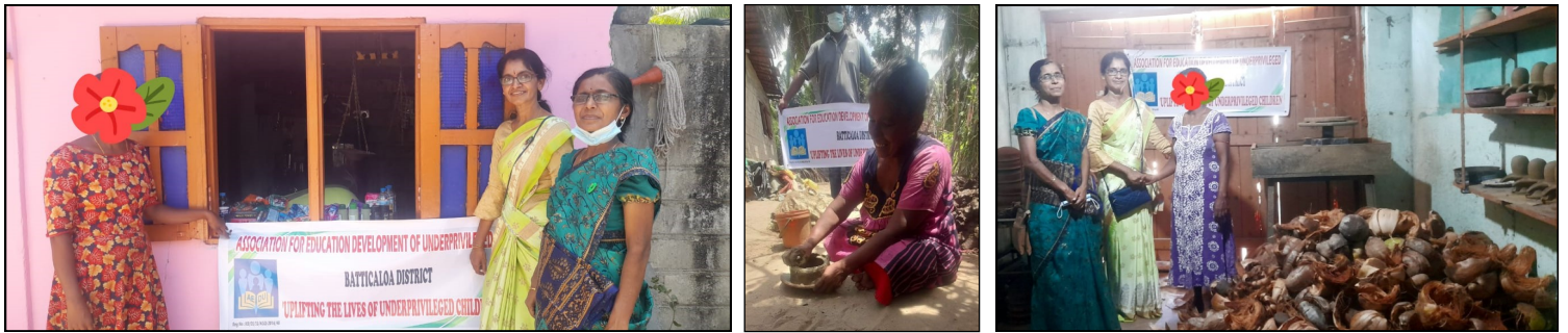
Community projects in Batticaloa supported by AEDU Batticaloa

Following the success of these projects and the return of a proportion of start up funds, we are planning to support 5 community projects in each AEDU district. Each project will receive seed funding of up to Rs.100,000.