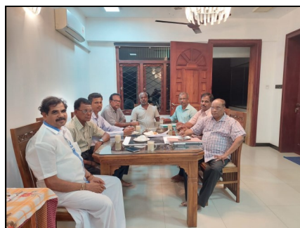
The new AEDU Mannar Committee