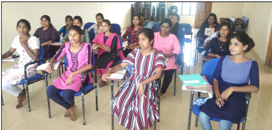
Students on the HCA training programme