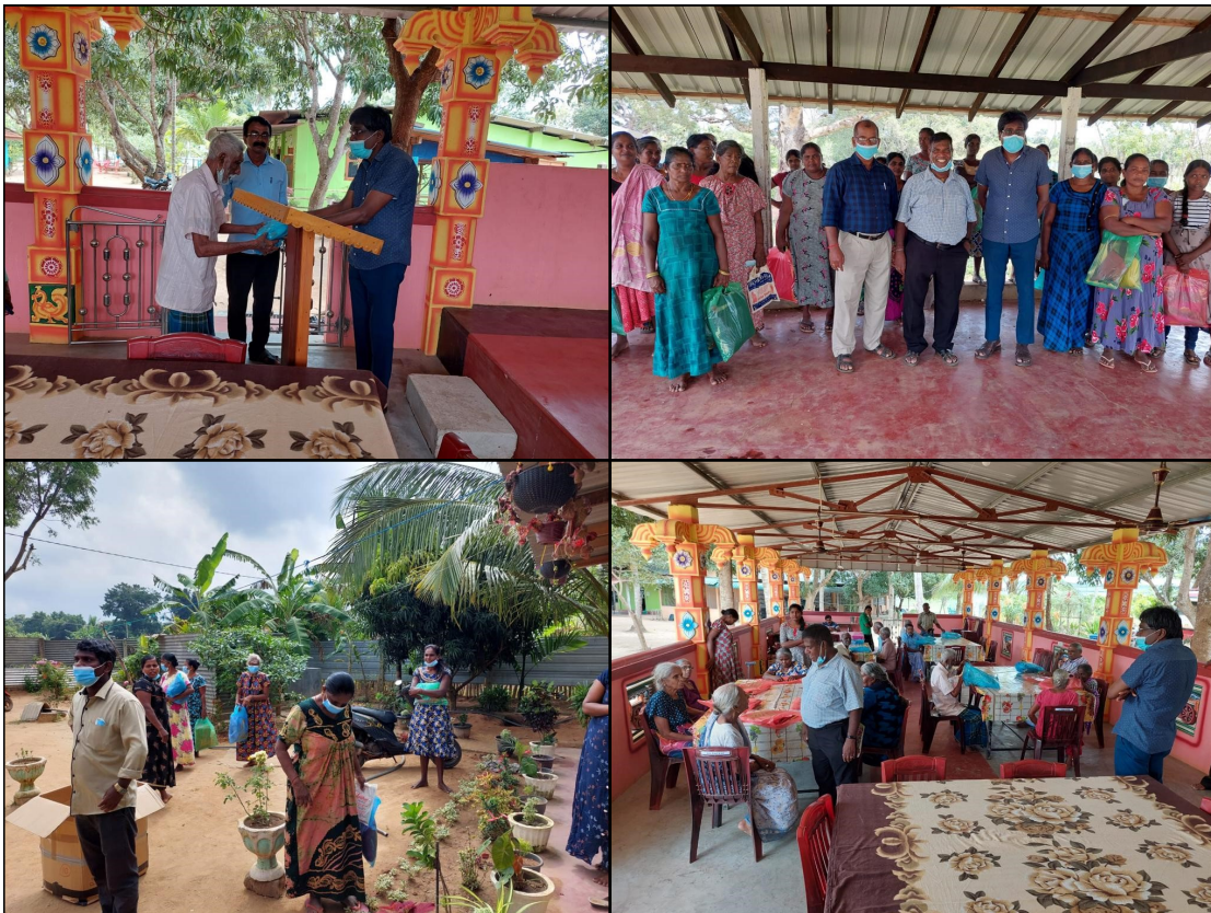
Distribution of saris donated by Sri Raja Rajeswari Amman Temple to beneficiaries in Kilinochchi by AEDU volunteers

The AEDU UK committee thank the trustees and devotees of Sri Raja Rajeswari Amman Temple for their invaluable support and generous donations.